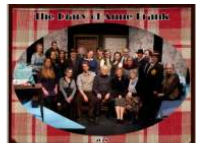
Cast and Crew photo