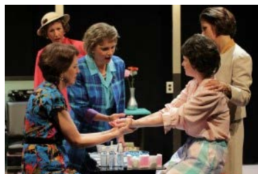
the ladies at truvy's

Robert Harling's 1987 play Steel Magnolias has been almost entirely eclipsed in our collective consciousness by the 1989 Herbert Ross film of the same name starring Shirley MacLaine, Dolly Parton, Sally Field and Julia Roberts. When characters have become so culturally iconic it can be a challenge to bring them back to the stage, but Theatre Arts Guild does just that in their heartfelt production that plays at the Pond Playhouse Theatre until October 5 th .